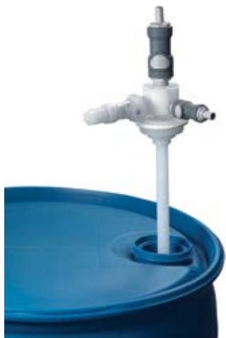
Universal 3-Port Drum Adaptor Kit (shown with HFC12 and NS4)