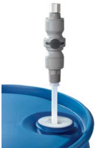
Universal Drum Adaptor Kit (shown with NSH Series)